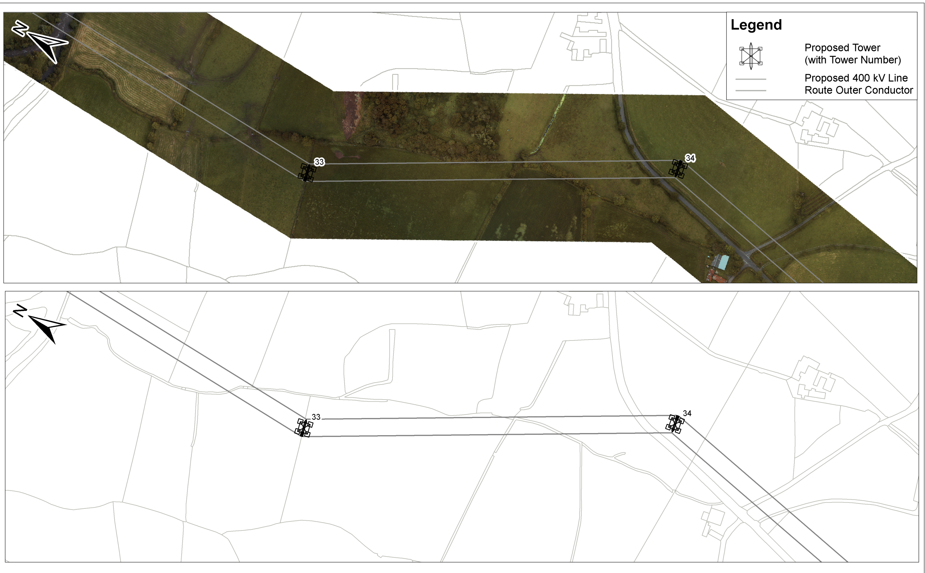
View 2: 1/2,500